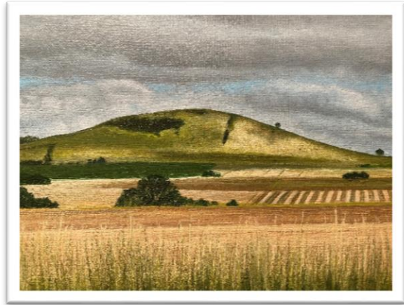
“Farmlands W heatsheaf” Oil on canvas, 50 x 40 cm