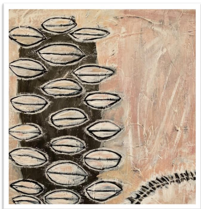
“Fleur II” Mixed Media on Canvas $800