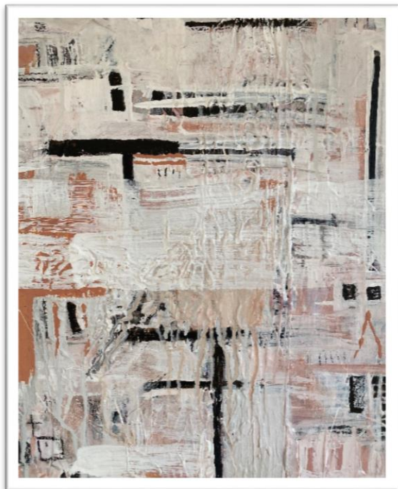
“Warm” Mixed Media on Canvas $700