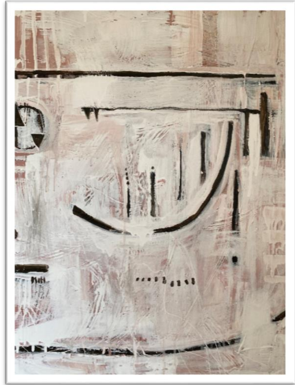
“Cold” Mixed Media on Canvas $800