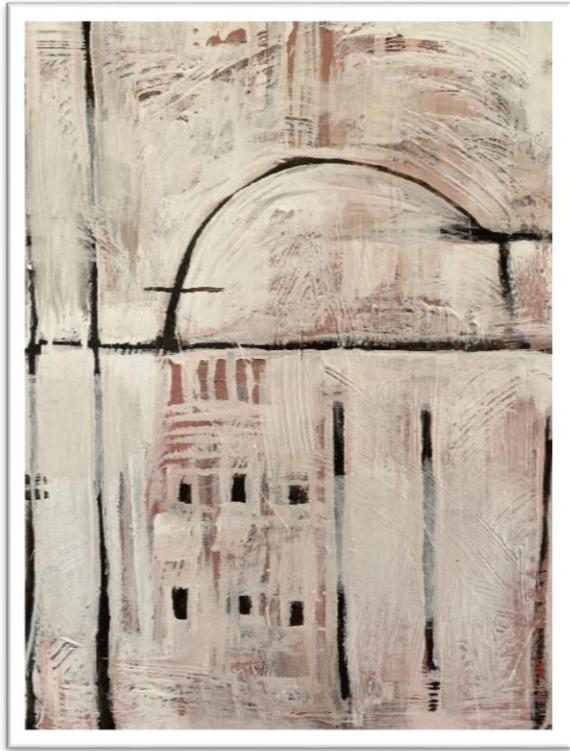
“Summer” Mixed Media on Canvas $800