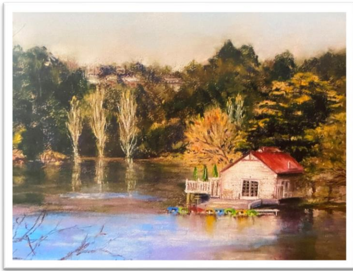
The Boathouse, Lake Daylesford: $895