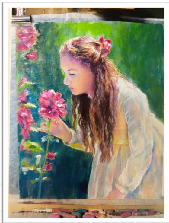
Hollyhocks, Lavendula: $995