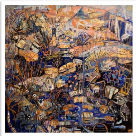
Earth meets Sky #2: $3,500