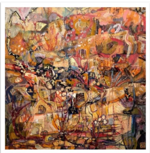
Earth meets Sky #1: $3,500