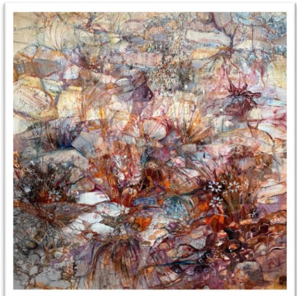
Spray Point: $3,500