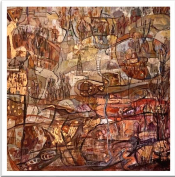
Promised Land: $3,900