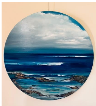
Pretty Tide 580cm $550