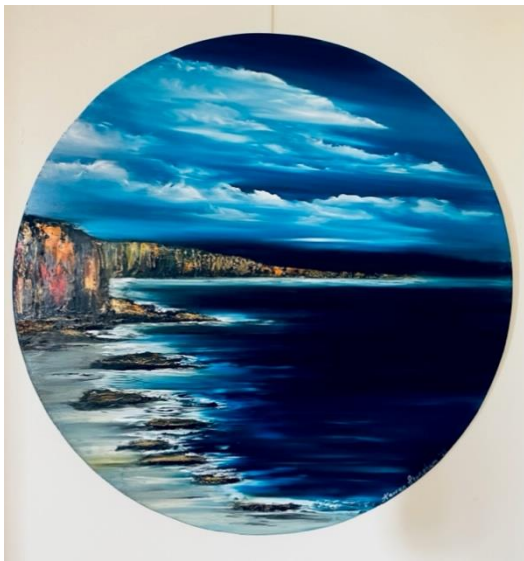
Last Light 850cm $950