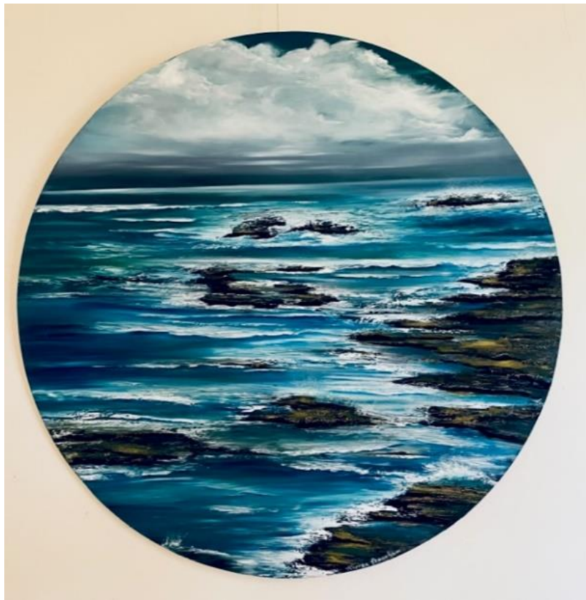
Birds Eye View 1200cm $1650