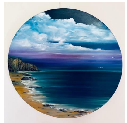
Emerging Day 580cm $550