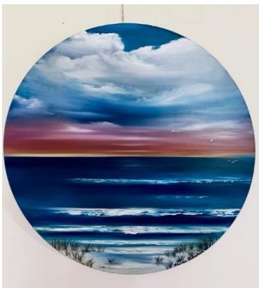
New Day 580cm $550