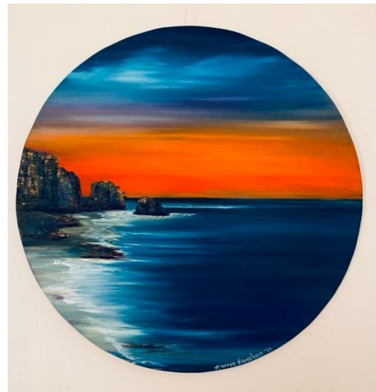
Summer Evening Glow 850cm $950