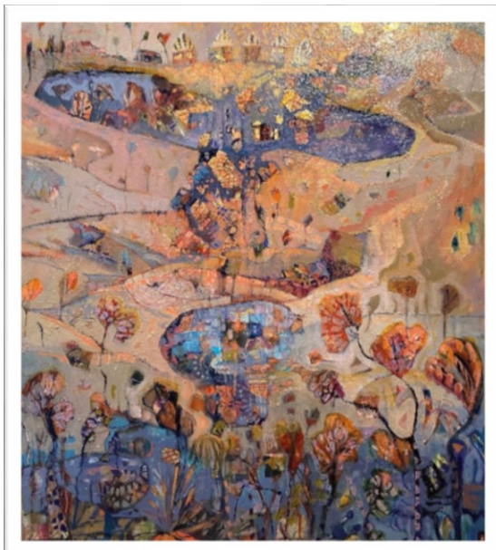
“Homeward Bound” Mixed media on Linen 1020 x 1020