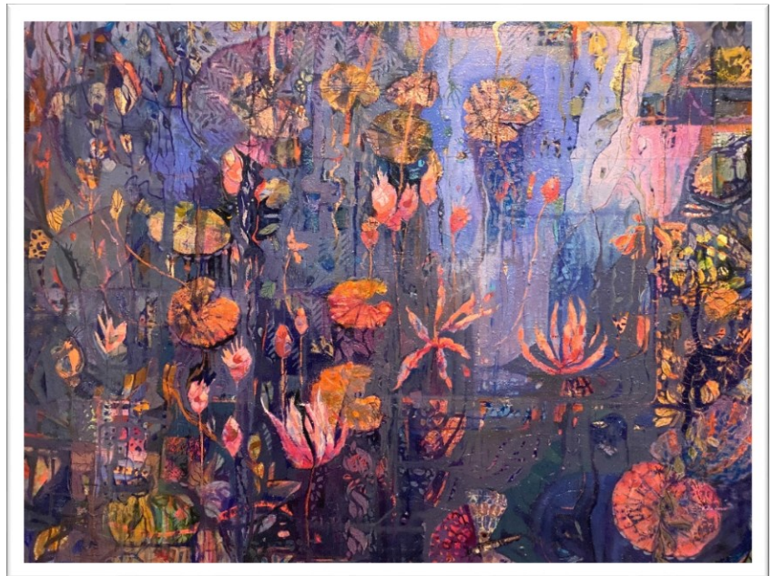
“Billabong Buzz” Mixed media on Linen 1220 x 1520