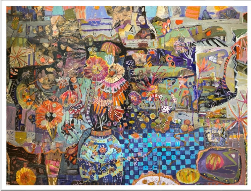
“La Dolce Vita” Mixed media on Linen 1020 x 1520