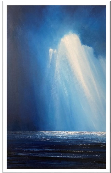
Light of Hope - $1,500