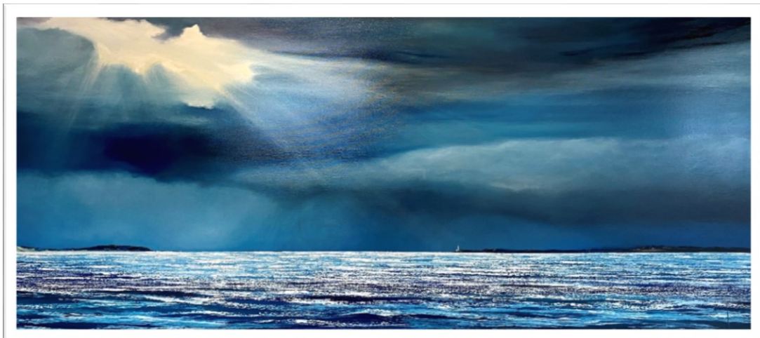
The Heads - $3,500