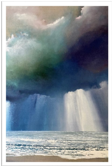
Shower Study - $890