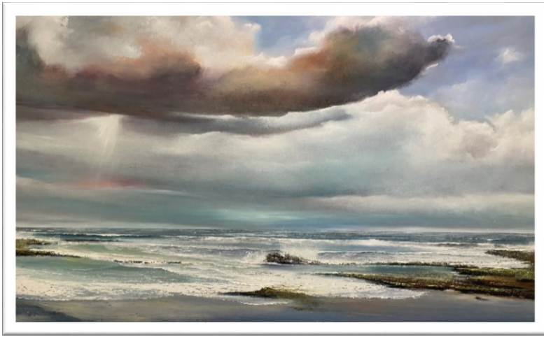
Lights Beams over 13 th Beach - $4,200