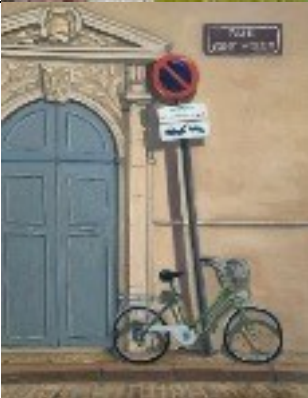
Rue Pont Vieux 39x49cm oil on panel $1500