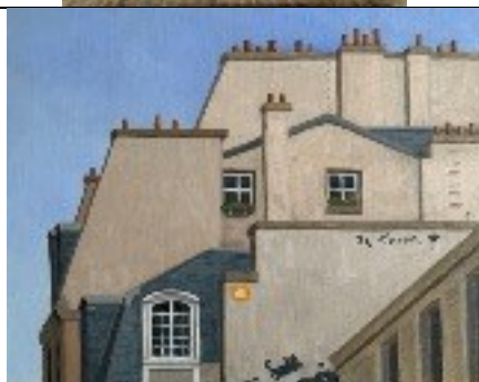
Paris, je t'aime 55x44cm oil on panel $1500