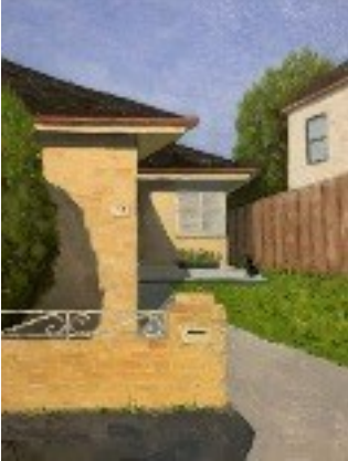
The cat at no. 7 34x44cm oil on panel $1020