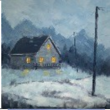
The Winter Cabin 23.5x23.5cm oil on panel $900