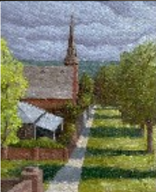
Looking down Wombat Hill 28.5x33.5cm oil on panel $1020