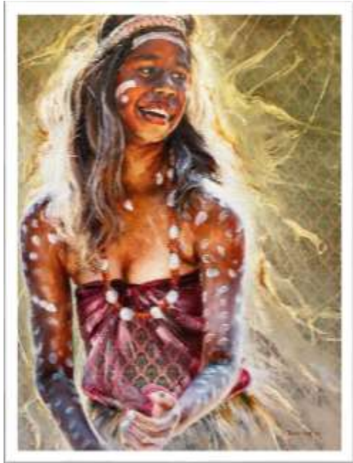
"The joy of it" - 121 x 91 - $7,500