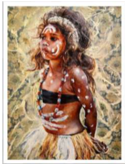
"Honey" - 121 x 91 - $7,500