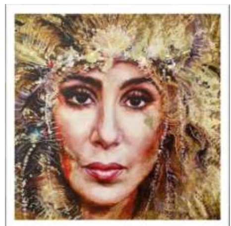
"Cher" - $3,600