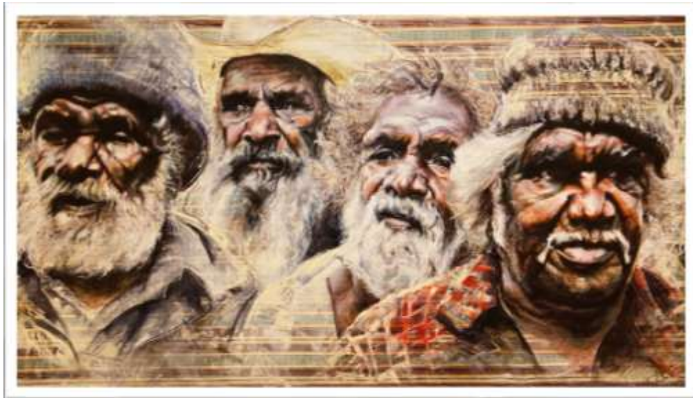
"Elders" - 105 x 200 - $15,000