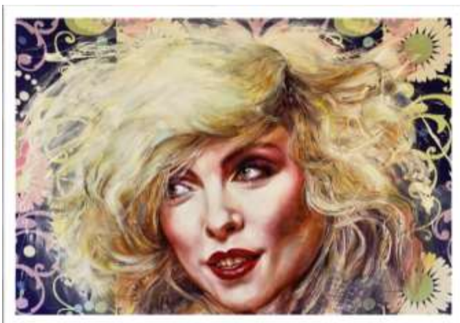
"Blondie" - 83cm x 120cm - $8,200